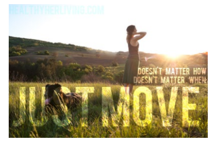
The Importance of Movement (during a pandemic and social distancing)

This class touches on the importance of taking care of yourself during social distancing and this pandemic period. This class focuses on a variety of areas that will make you and your family stronger during this time when social distancing and the fear of the unknown is causing everyone extra stress.