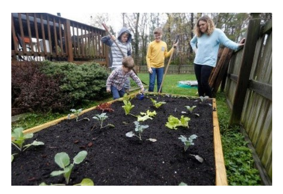
Grow & Give: A Modern Day Victory Garden

Having a modern day victory garden beats another trip to the grocery store - and the ability to get outside in the midst of stay-at-home orders and limited travel is a bonus!